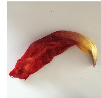
A LEAF OF FLOWER