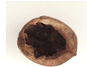
THE HALF OF A WALNUT CELL