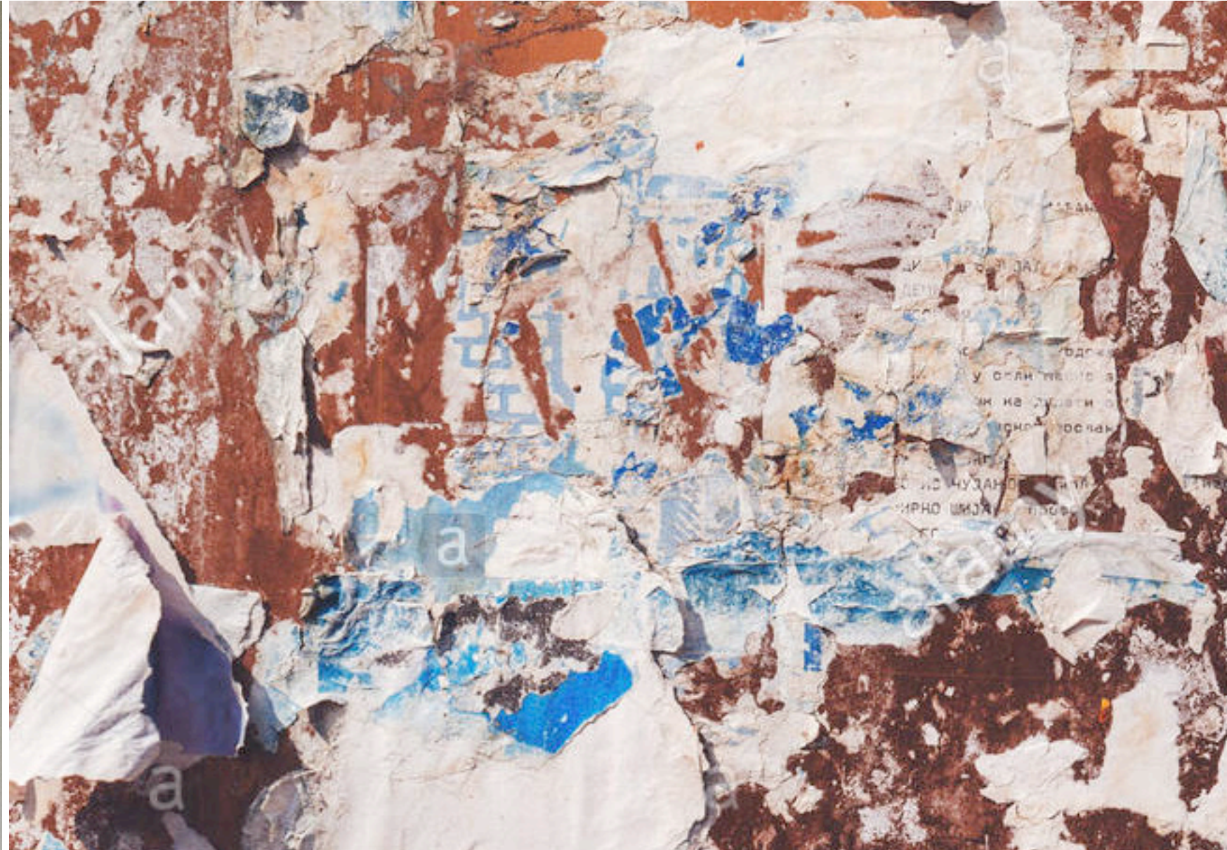
Old torn poster paper scraps texture on street wall // Blurred data. This is what can happen when your personal data stays online for ages. Layers and layers of information will be covered..