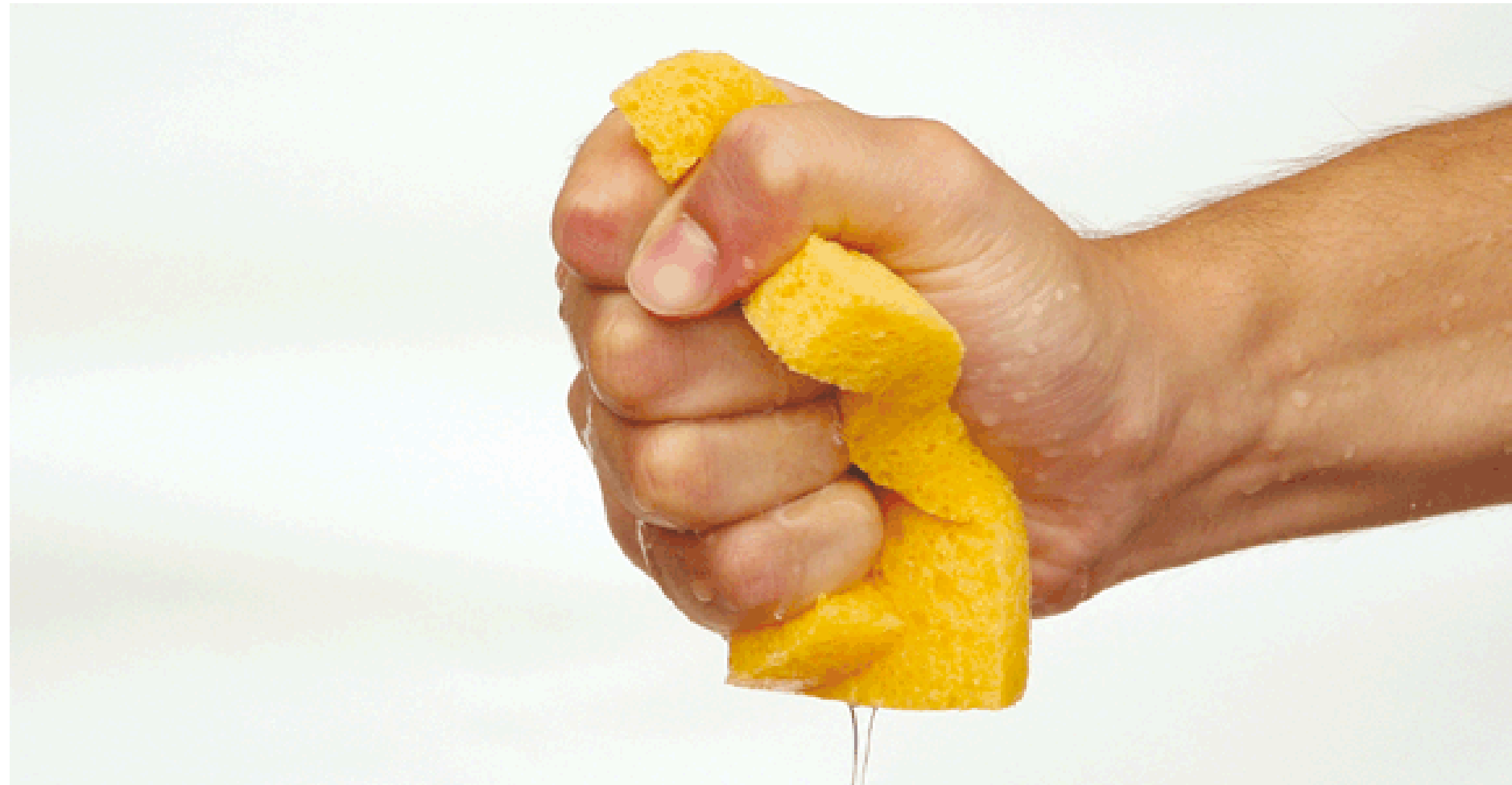
squeezing // deleting data in large quantities