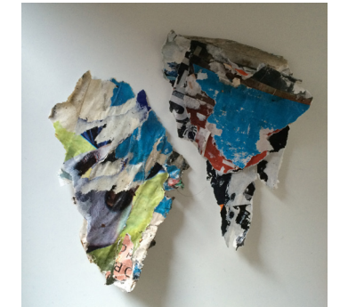
STREET POSTER SCRAPS