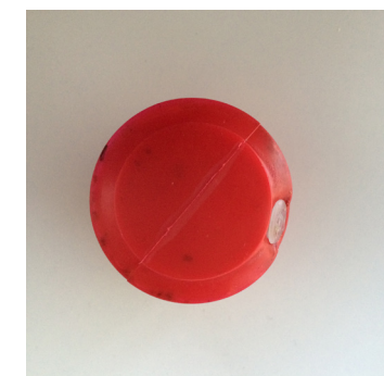
A AIR PUMP