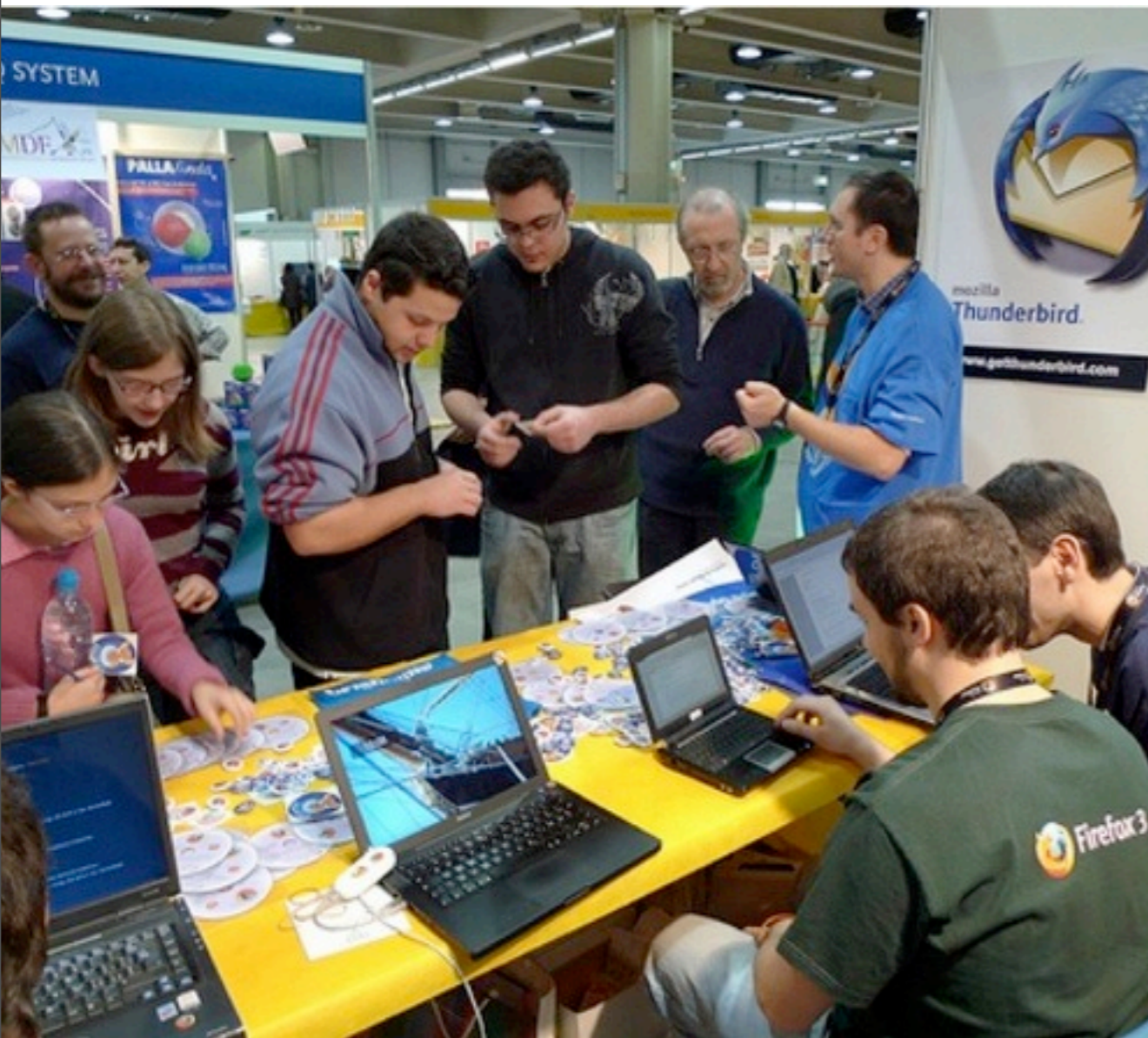
Fa la Cosa Giusta, Italia 2009