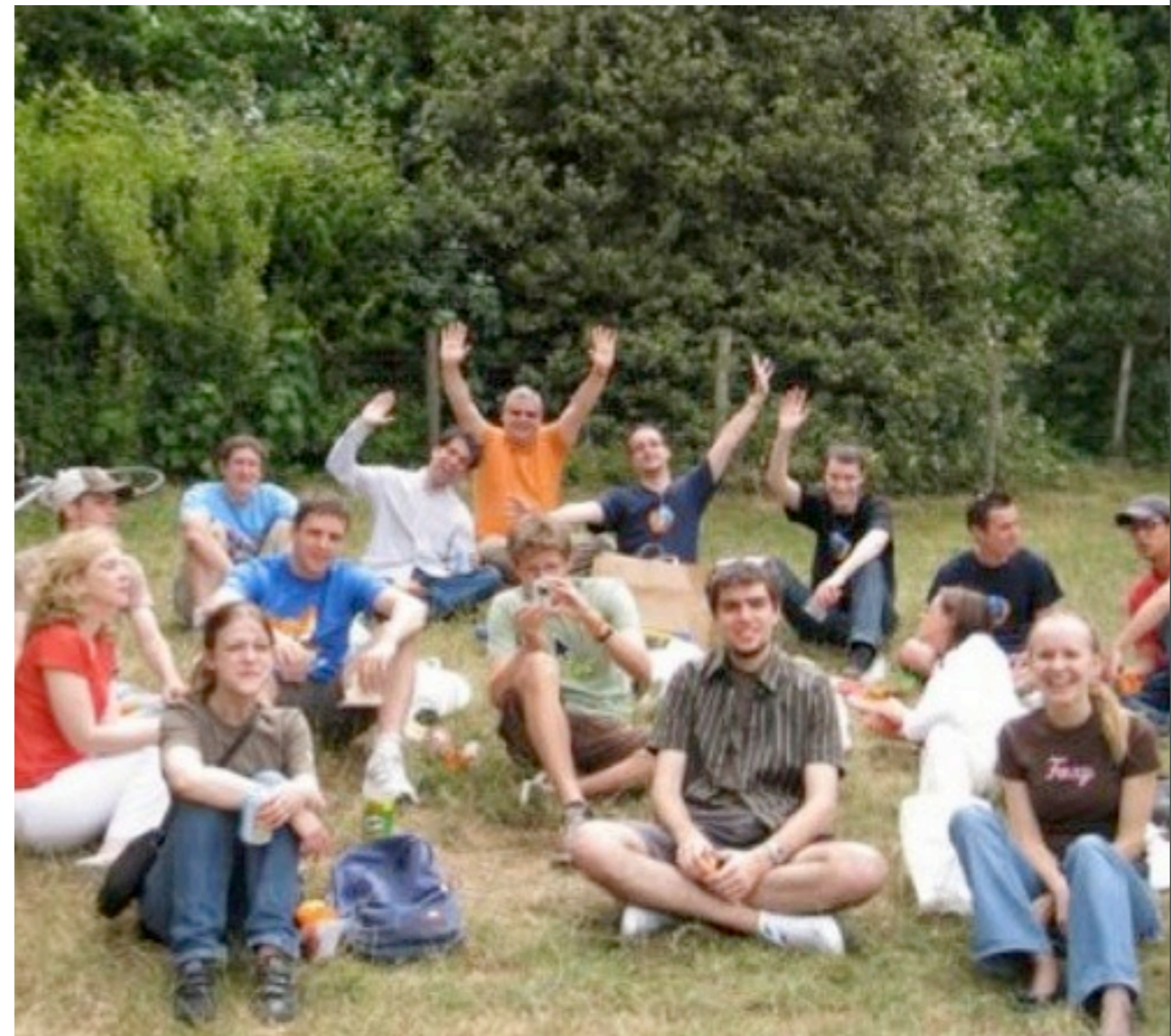
Mozilla Paris Picnic