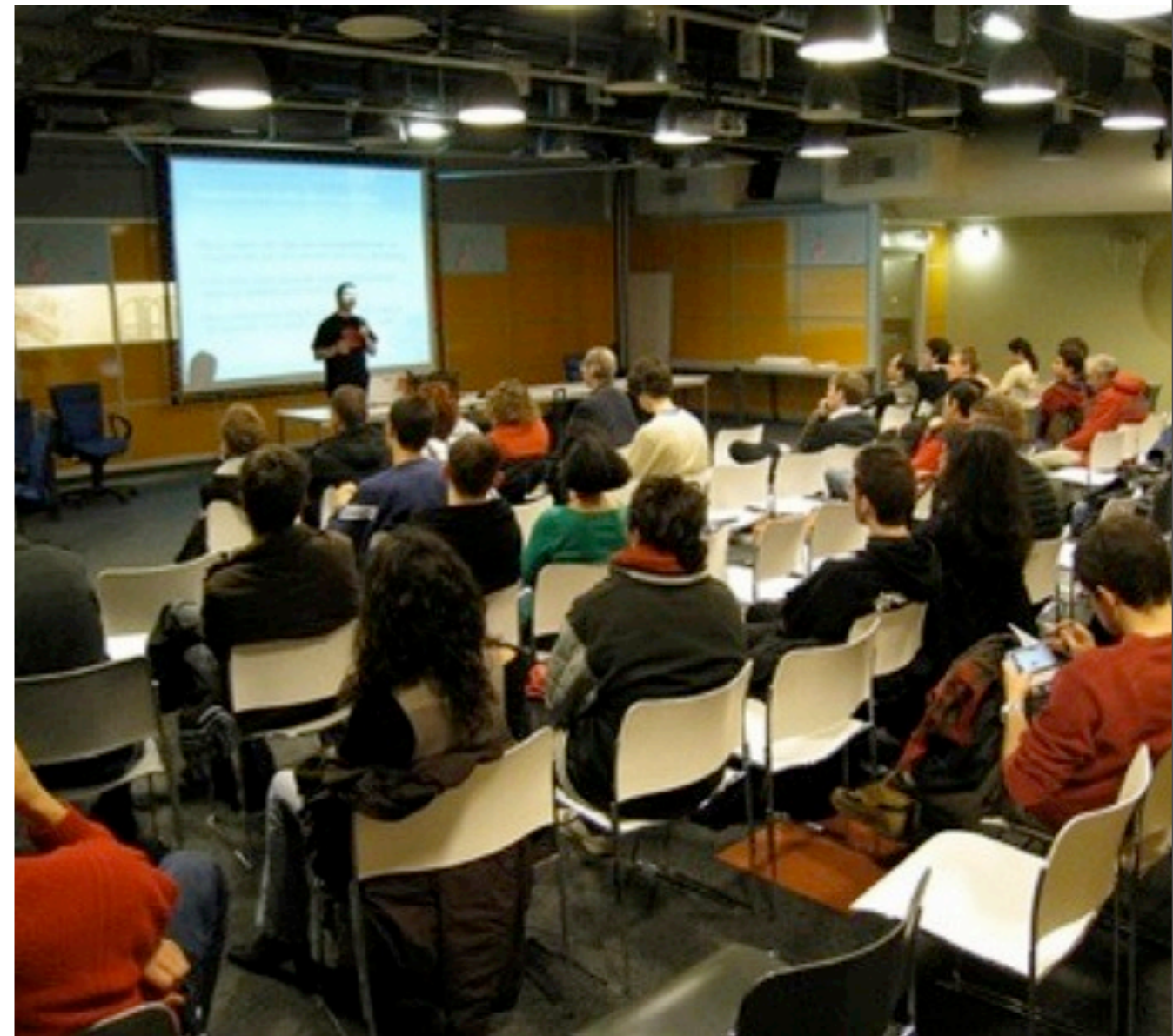
Ubuntu Launch Party 2009