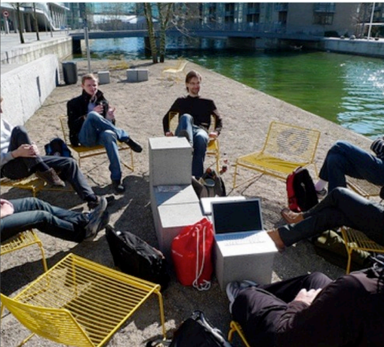
Mozilla Denmark Meetup